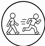
WALKING AND RUNNING