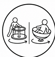
SPINNING AND ROLLING