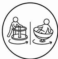
SPINNING AND ROLLING