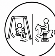
SWINGING / ROCKING

Our modular play system allows components to be mixed and matched to create the ideal play solution for each site. Platforms, slides, climbers, bridges, tunnels and play panels can be combined in countless configurations, enabling designs to be tailored to available space, budget, age range and community needs. Inclusivity is considered throughout the range, with a variety of accessible and sensory-rich play features available that can be seamlessly incorporated into designs to further enhance play opportunities for children of all abilities. This flexible approach ensures every playground delivers maximum play value while creating a unique and engaging environment for its users.