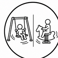
SWINGING / ROCKING

Our modular play system allows components to be mixed and matched to create the ideal play solution for each site. Platforms, slides, climbers, bridges, tunnels and play panels can be combined in countless configurations, enabling designs to be tailored to available space, budget, age range and community needs. Inclusivity is considered throughout the range, with a variety of accessible and sensory-rich play features available that can be seamlessly incorporated into designs to further enhance play opportunities for children of all abilities. This flexible approach ensures every playground delivers maximum play value while creating a unique and engaging environment for its users.